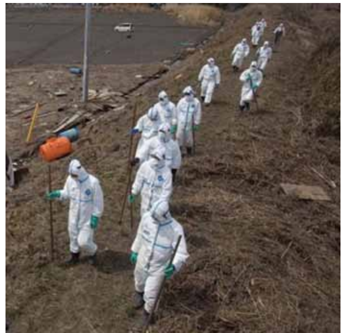
Heavily-suited clean up team near Fukushima, in an area where absolutely nobody was killed or injured from nuclear radiation

table showing leukemia incidence in the Hiroshima population, which was lower by 66.3% in survivors exposed to 20 mSv, compared to the unexposed group (p.165). This evidence of radiation hormesis was not commented upon. Since then, the standard policy line of UNSCEAR and of international and national regulatory bodies over many decades has been to ignore any evidence of radiation hormesis and to promote LNT philosophy.”