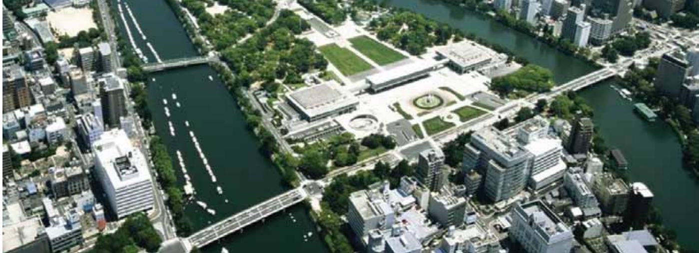
The city of Hiroshima as it appears today