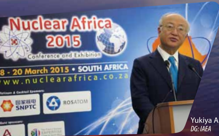
Yukiya Amano DG: IAEA